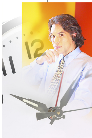
Are You Managing Your Time Effectively?